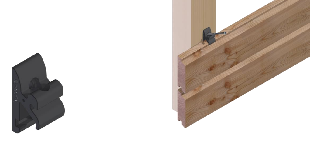
Figure A.1. Principle of the fixing system